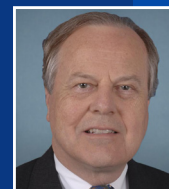
REPRESENTATIVE ED WHITFIELD FORMER US REPRESENTATIVE FOR KENTUCKY'S 1ST CONGRESSIONAL DISTRICT. FARRAGUT PARTNERS LLP