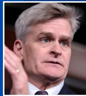
SENATOR BILL CASSIDY, MD US SENATOR FROM LOUISIANA. SERVES ON HEALTH EDUCATION LABOR & PENSIONS COMMITTEE